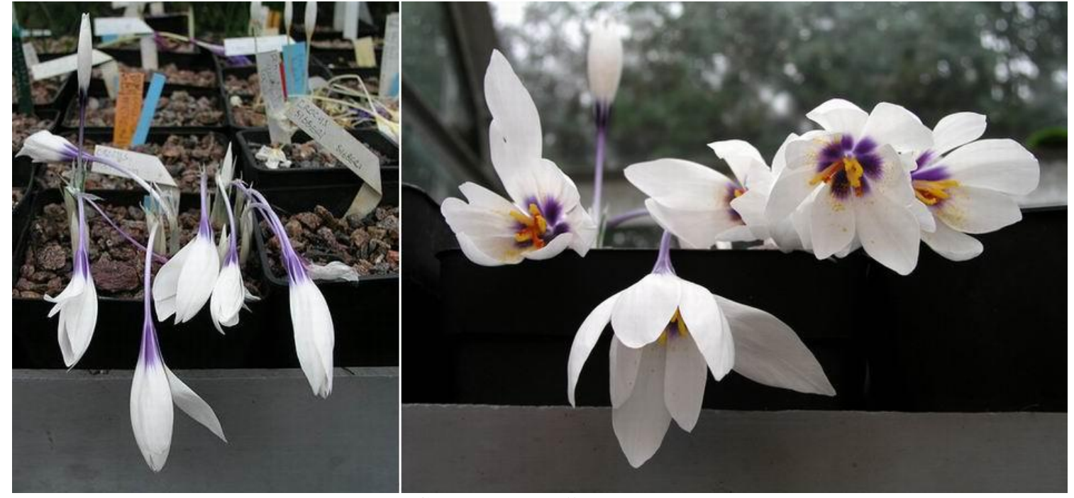
Crocus mathewii next day

Today the flowers have all flopped over without having opened at all. I did prise them open yesterday to pollinate them in the hope of getting a good seed set. Pollination is usually successful and I have had reasonable good seed crops from it over the last few years. I hope to see the first flowers from this seed, if not this year then next, and it will be interesting to see what variation there is in the seedlings. A quick trip out after lunch and the flowers have started to open even in their flopped over condition, I will have another go with the paint brush to ensure a good transfer of pollen.