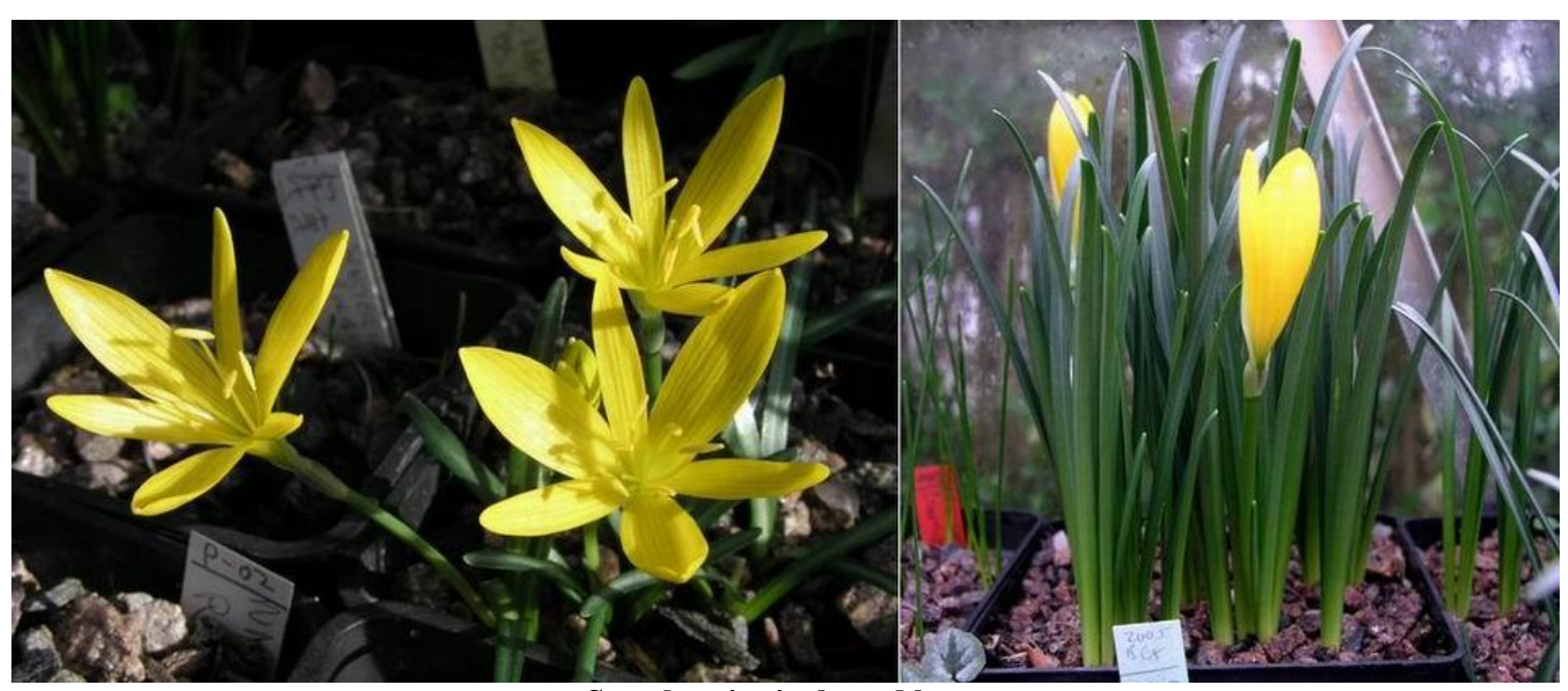
Sternbergia sicula and lutea

The first buds have appeared on several of the forms and hybrids of Narcissus cantabricus such as foliosus on the left and N. 'Camoro' on the right. This is absolutely in line with my prediction that, if we have mild weather when the roots are forming, then the Narcissus will flower early.