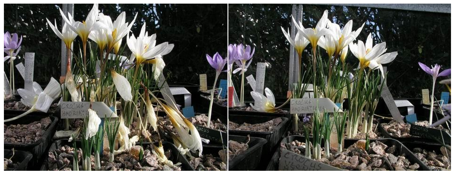
Crocus flowers going over

As the flowers of the crocus go over it is essential to remove them as they will quickly attract rots such as botrytis which can transfer on to the leaves and down to the corm, if it gets a hold. Notice I have removed all the faded flowers from this pot in the picture on the right by giving them a sharp tug upwards while placing my fingers on the gravel to prevent disturbing the corm below. Yet another good reason that I love crocus is that most of them send up a second flush of flowers a few days or a week after their first flowering. This feature is part of their survival mechanism so if their first flowers coincide with poor weather conditions and not many pollinators then they have a second chance. We also benefit from his with two wonderful displays of blooms and must in turn reward the plant by pollinating with the paint brush to get the seed set we all want.